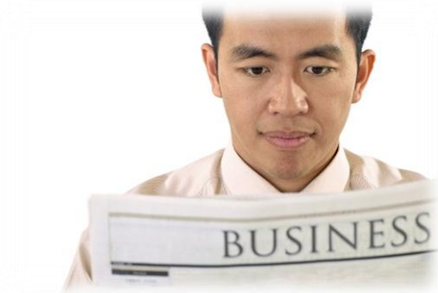
Years 2002 - 2011

100 million distributors around the world are involved in Direct Selling, including China, and that number increased by more than 14% last year. The graphic below represents the growth in Year 2002 - 2011.